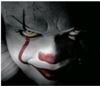
2017 version of "It"

The month of October brings its monthly share of horror films along with its horror movie lovers. In a survey of 20 students, 18 students plan to see "The Snowman" released October 20. All twenty students confessed to seeing the remake of the 1997