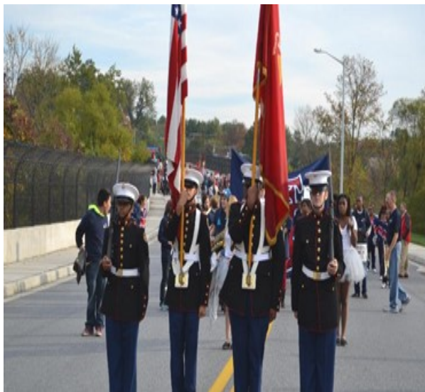
Franklin JROTC color guard marching in the Reisterstown festival with pride.

Since Franklin HS JROTC is one of the best, they are usually exempt from the inspection, but the Corps recently decided to also inspect the honor schools. Overall, the cadets did an outstanding job. Keep in mind that most of them woke up around five in the morning to be at the gym by 5:50am for the inspection which started at 6am. PSAT was also that day, and many cadets had to take the PSAT either before or after and still got good results. Only five cadets out of all the classes were absent. Also, two other high schools were supposed to do the inspection as well, but they didn't have enough confidence in their cadets, unlike Gunny and Master Guns. "We couldn't be any prouder in our cadets. They are a pain, but they never fail to impress us," said Gunny. Great job to all the cadets.