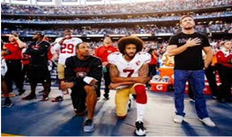
Colin Kaepernick kneeling during National Anthem with a teammate