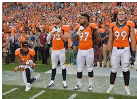
NFL players seen kneeling and standing during National Anthem.