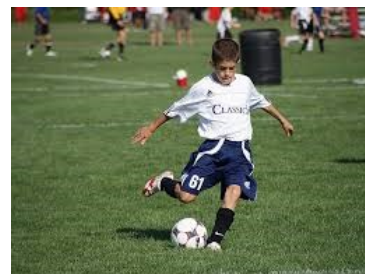
Pulisic as a child

Looking to the future, he will plan to work up the rankings in Dortmund and continue to win titles. Also he will look to grow the US team and lead them in becoming an international powerhouse.