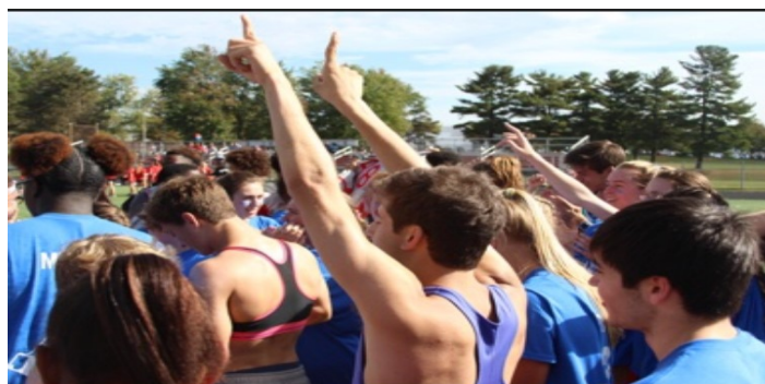
Pictured above is the senior celebration after winning their second straight Powder-Puff title.