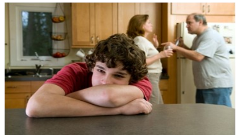
Teen being negatively affected by parents feuding. http://www.mghclaycenter.org/parenting-concerns/families/when-parents-have-an-argument/