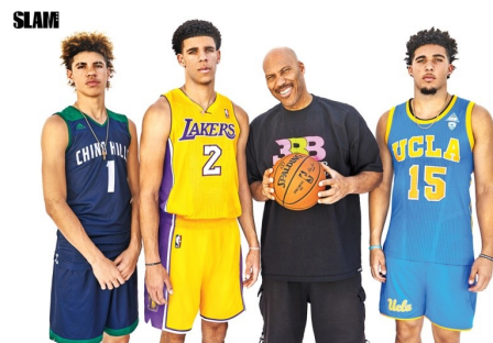
Ball Family. Lamelo, Lonzo, Lavar and LiAngelo (left to right)

teer. Role Model. Embellisher. Genius. Troublemaker." Regardless of the Ball brothers, UCLA also added five star point guard Jaylen Hands and should be expected to be a top team this season.